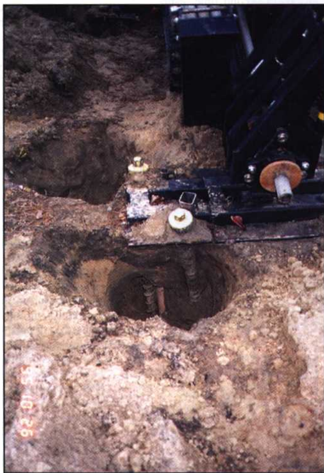
This drilling operator thought he only had to worry about gas mains across the street until he hit a 2-in. PE gas main. He even put three anchors within 4 in. of three gas lines, as this photo illustrates.

People who are involved in enforcement of damage prevention laws agree that most excavators and facility operators try to do the right thing most of the time, but are willing to cut corners when faced with time pressures or stiff competition. Most hits occur because people do not understand the significance of something they did or failed to do. When people understand the system, they have fewer problems. When they